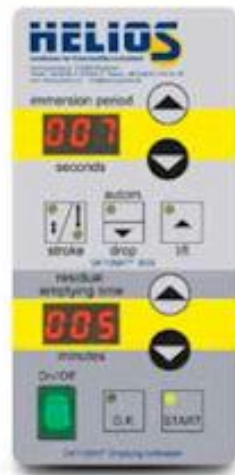
Optional 1/2/5/9/10 control