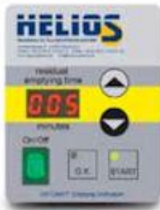
Optional 1/2 control