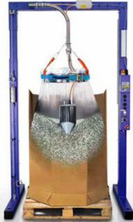
CLASSIC PLUS with option 1

Complete discharging with no operator required, without lifting, tipping or rotating the full container and the problems associated with those operations.