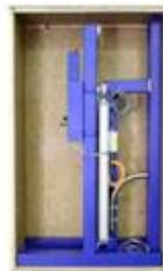
pre-assembled in the transport case